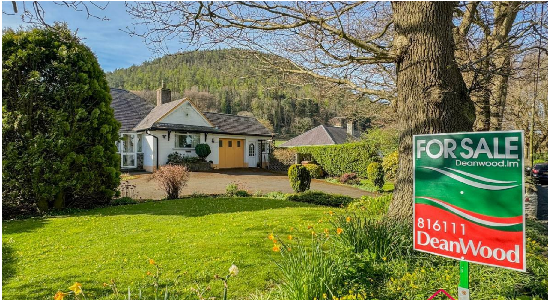
Altadale Lezayre Road, Ramsey, Isle Of Man, IM7 2AJ Asking Price £499,950